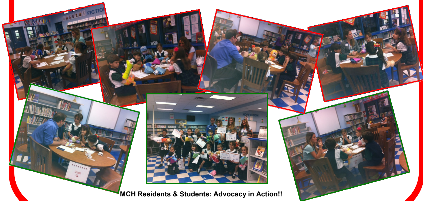
MCH Residents & Students: Advocacy in Action!!